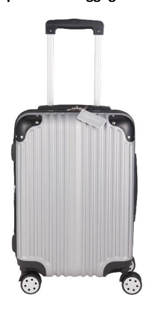
Upright Expandable Luggage with Tag

Travel in style with this metallic upright expandable luggage. This luggage piece features a zippered main compartment with the option to expand, maximizing space and packing flexibility. With the four spinner wheels and multi-stage trolley handle, taking this luggage through the airport will be a breeze. A McMaster University crested luggage tag is included.